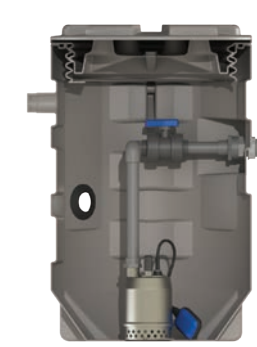
Sanifos 280 Steel

• Tank with pre-assembled hydraulics, isolation valve and non-return valve, Sanisub ZPK 40 A or Sanisub Steel 50 A pump, PVC piping